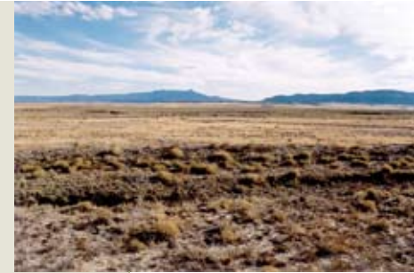
Seven Lakes Ranch, Las Animas County

Individuals who wish to purchase a Credit and apply it to their taxes in a given year, have until the tax filing deadline (typically April 15th) of the following year to complete the Credit transfer. This means that most Credits will be transferred, and payments to landowners made, in the first quarter of the year after the donation of the conservation easement.