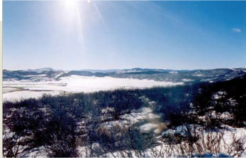
Park Creek Ranch, Larimer County; Edie & Ken Yates

A conservation easement is a written agreement between a landowner and a land trust or local government open space program that preserves the conservation and, if applicable, agricultural values of the land. At the same time, it allows a landowner continued ownership and use of the land consistent with the terms of the easement. Considerations in drafting an easement include: the characteristics of the property, the conservation values to be protected, and each party's needs and expectations.