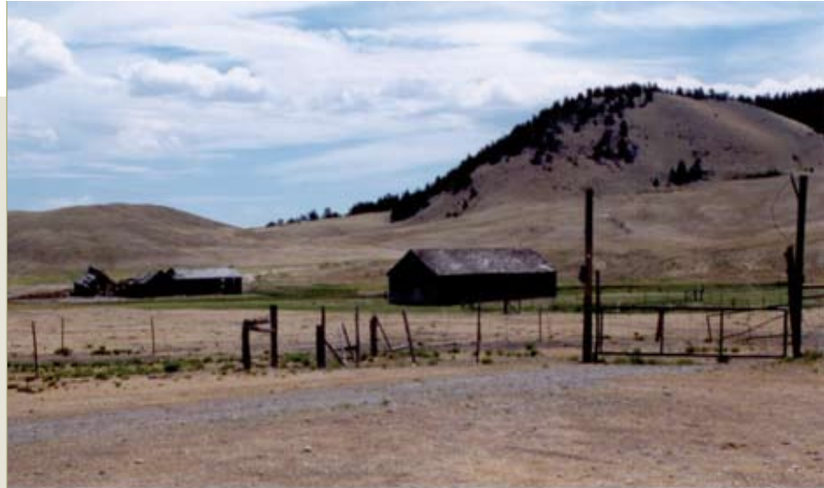
Saltworks Ranch, Park County

(Please see page 7, "How Can I Transfer a Colorado Conservation Tax Credit?")