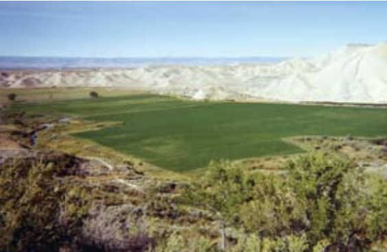
Kehmeier Ranch, Delta County