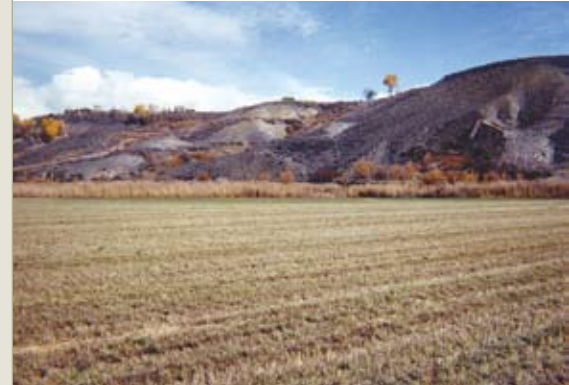
Kehmeier Ranch, Delta County

The ability to transfer Credits has enabled many landowners to protect important conservation and agriculturally significant areas in Colorado – landowners who would otherwise be financially unable to preserve their land through a conservation easement.