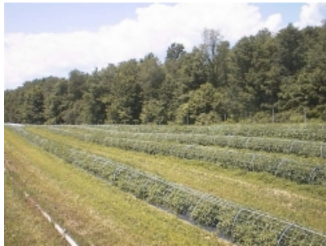
Tomatoes growing on Maple Farm