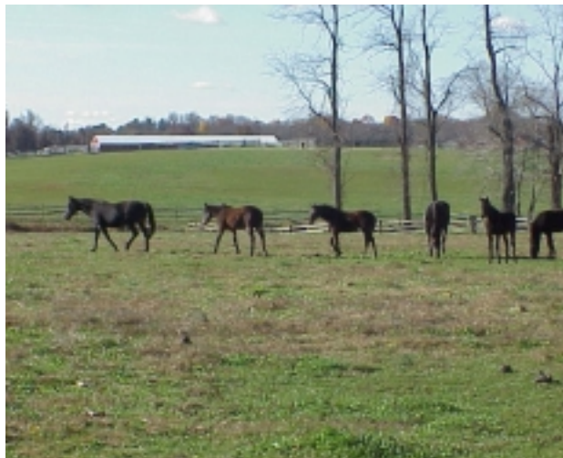
The transfer of the property is now 70 percent complete through an annual asset-gifting process