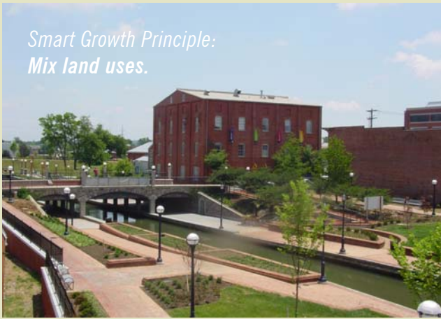
Smart Growth Principle: Mix land uses.