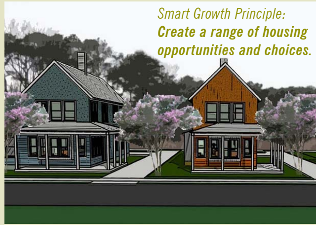
Smart Growth Principle: Create a range of housing opportunities and choices.

www.cityoffrederick.com/carrollcreek/pics.htm