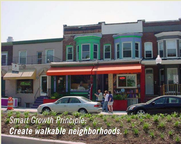
Photo: Lorie Schoettler Neighborhoods of Greater Lauraville, Inc. (NOGLI)