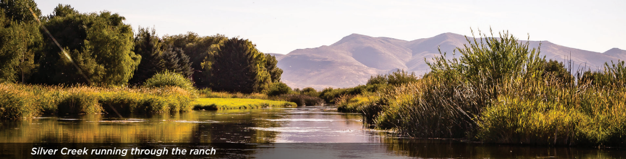
Silver Creek running through the ranch