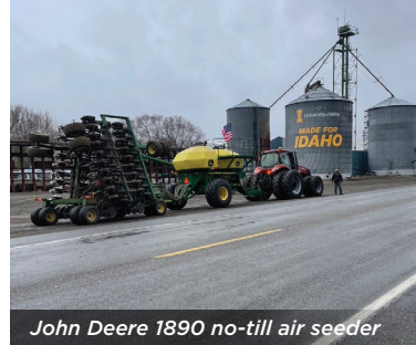
John Deere 1890 no-till air seeder