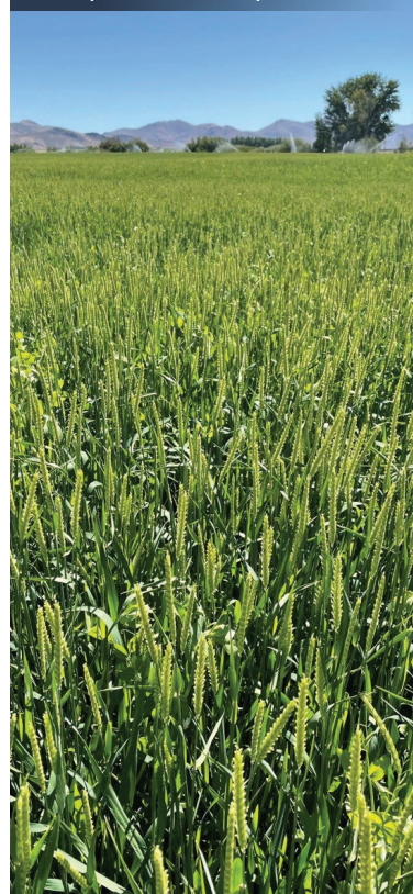
Multispecies cover crop mix

SOIL HEALTH PRACTICES: No-till, cover crops & nutrient management