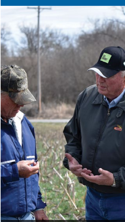
Scotty discussing soil health practices with another producer

SOIL HEALTH PRACTICES: Cover crops, strip-till & no-till, nutrient management