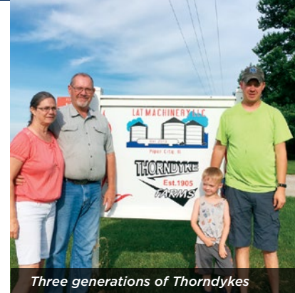
Three generations of Thorndykes

Additional benefits come in the form of lower machinery costs due to less fuel and labor needed with less tillage and using one less fertilizer pass thanks to application of P and