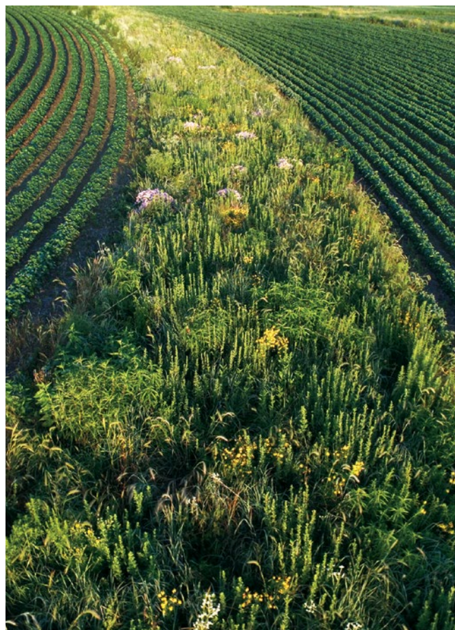
IOWA STATE UNIVERSITY STRIPS PROJECT

An increasing number of land trusts are offering additional services to support farmers and ranchers. Thirty-three percent of land trusts (83) help with estate and/or succession planning and farm/ranch transfer, an 84 percent increase from our 2017 survey. Thirty-nine percent (98) say they lease land to farmers and ranchers, and 17 percent maintain a list of farm seekers and/or farms for sale, a 79 percent increase from the previous survey. While only 11 percent (28) sell protected farms or ranches to commercial operators, this represents a 133 percent increase from 2017.