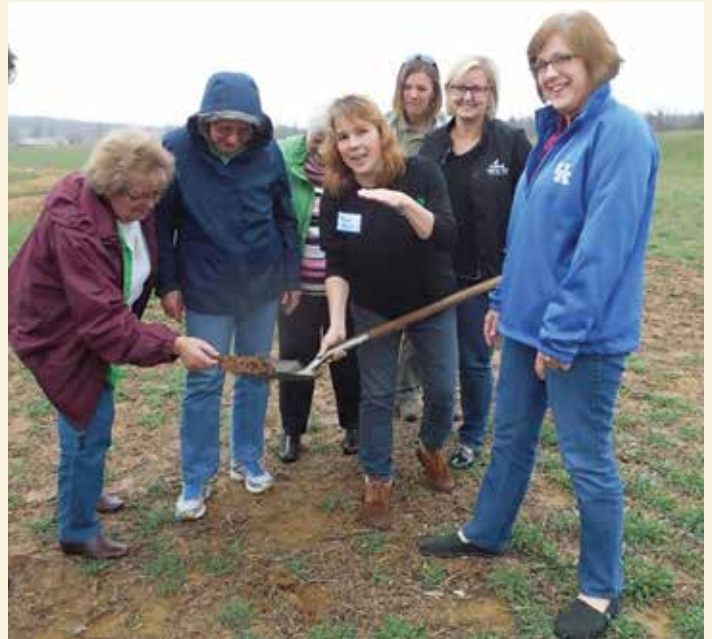
A WFAN Women Caring for the Land event held in Kentucky pre-COVID.

resources (though these still did not meet the quality of in-person networking).