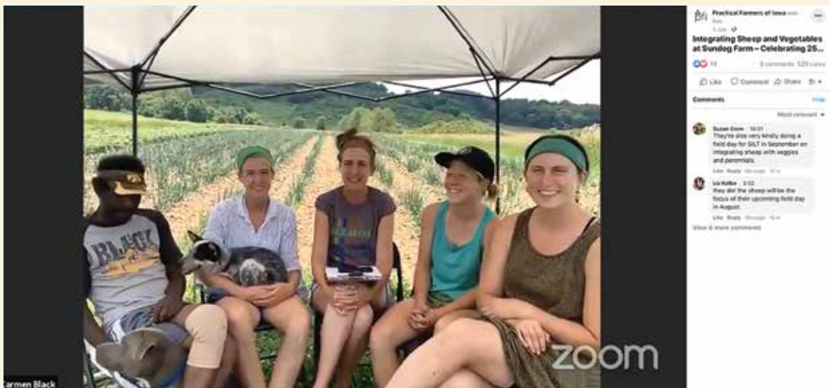
A virtual field day held on Zoom.

Everyone on staff and all our farmer speakers have stepped up and adapted, and we were able to provide flexibility within our formats to accommodate the vision of our staff and speakers. There is a core team of about seven people that contributes to various dimensions of the inner workings of our virtual field day season. We've become a well-oiled machine, and when something changes requiring action from the team, it's fun to see everyone's names pop up in comments responding to their specific niche. I think I find that aspect of teamwork even more energizing now that we are working apart from one another. Knowing that my coworkers are simultaneously working on the same thing is nice—we're together in a sense.